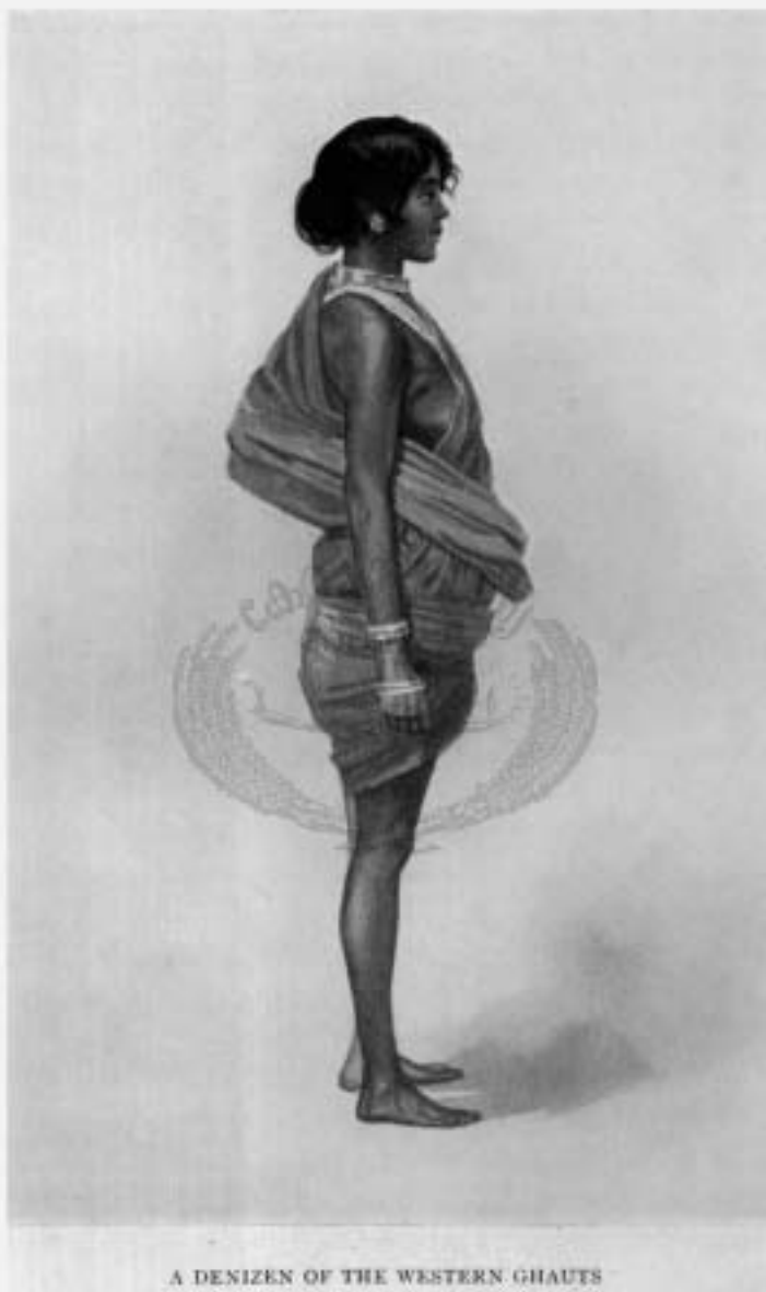
A DENIZEN OF THE WESTERN GHAUITS